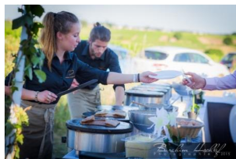
The typical « crêpes »

Therefore, we look forward to welcome you in Nantes in 2018 for the 34 th AETE meeting. We hope that you will have a successful meeting and will enjoy your stay in the beautiful city of Nantes.