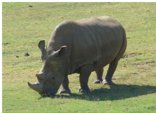
Northern White Rhinoceros