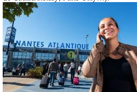
View of Nantes Atlantic Airport.

Nantes Atlantique Airport (LFRS-NTE) serves 65 national and international destinations by direct flight Madrid, London, Amsterdam are at only one hour and a half flight from Nantes! Many cities are directly connected to Nantes Atlantique Airport: from European countries (Alicante, Amsterdam, Barcelona, Berlin, Brussels, Dublin, Dusseldorf, Edinburg, Gatwick, Geneva, Hamburg, Lisbon, Liverpool, London, Luton, Madrid, Munich, Porto, Varna, Vienna, Southampton...) and from France (Lille, Lyon, Marseille, Nice, Paris Charles de Gaulle/Roissy, Paris Orly...).