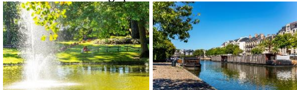
View of botanic garden (left) and the banks of Erdre (right)

politics for sustainable development, which allowed a high quality of life in the metropolis. With more than 100 parks and gardens, 13,000 hectares of protected spaces and 3,000 hectares of accessible green spaces in greater Nantes, there is no lack of breathing space!