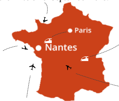
The French map with Nantes's localisation