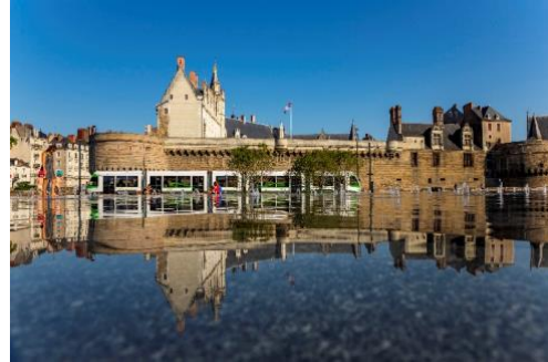
View of the Castle of the Dukes of Brittany downtown of Nantes.

Nantes was a port city, near the Atlantic Ocean, which has developed thanks to its river La Loire. In the 15 th century, Nantes became the capital of the Bretagne, a crucial place for political power and the life of the Court. This period was marked by the construction of the Castle of the Dukes of Brittany, the cathedral Saint-Pierre et Saint-Paul, that you can visit during your free time.