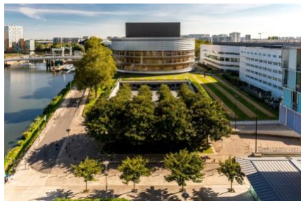
View of La Cité, Nantes events Center.