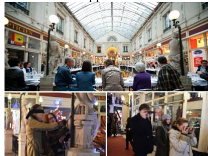
View of the "passage Pommeraye".

In 1843 under the last king Louis-Philippe's reign, "le passage Pommeraye" was inaugurated. The name of this commercial passage (with 66 shops) derives from a young notary called Louis Pommeraye, who wanted to transform an unsafe and bad neighbourhood to a passage with luxurious shops as in Paris. Classified as historic monument since 1976, this commercial passage is an amazing place to stroll with an exuberant decoration from a mix between neo-classicism and Louis Philippe's eclecticism.