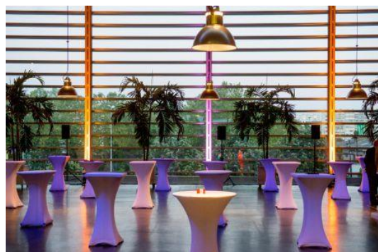
View of La Mezzanine, La Cité

For those of you who will be arriving on Thursday the 6 th , a welcome reception will take place at the Mezzanine level at La Cité Congress Centre, where registration and the AETE scientific congress will be held.