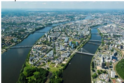
Panoramic view of Nantes and its island.

Nantes, ranked 6 th of the largest cities from France, is located at the mouth of the longest river in France, La Loire, which is the last wild river in Europe.