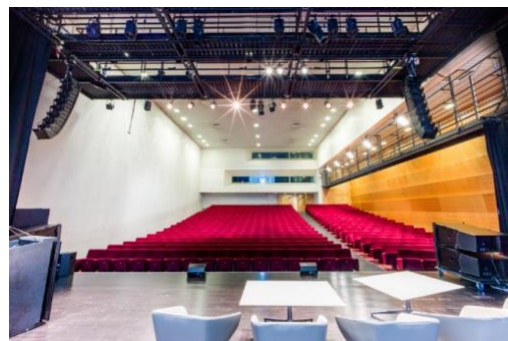
View of the auditorium, La Cité Nantes events Centre