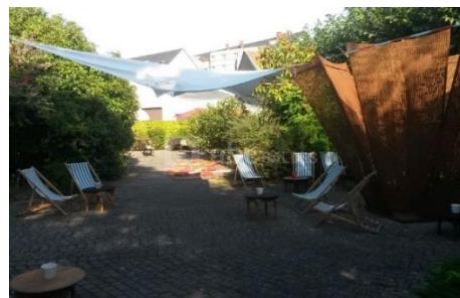
Les Salons des Floralies

The farewell party will take place at “Les Salons des Floralies”, where you can taste the regional speciality “les crêpes” in its salty and sweet forms accompanied by local cider! You’ll get a warm welcome from a traditional music band and a dancing group from Nantes will show us traditional folklore dances from Brittany!