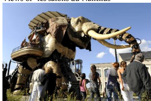
The Great Elephant from “les Machines de l’île”.